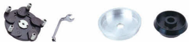
UA Universal Adapter ACS Cone Kit for Light Trucks (F150 F350)