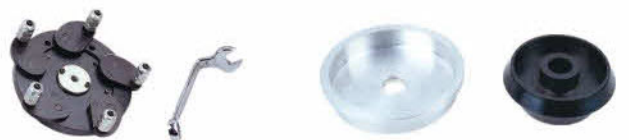
UA Universal Adapter